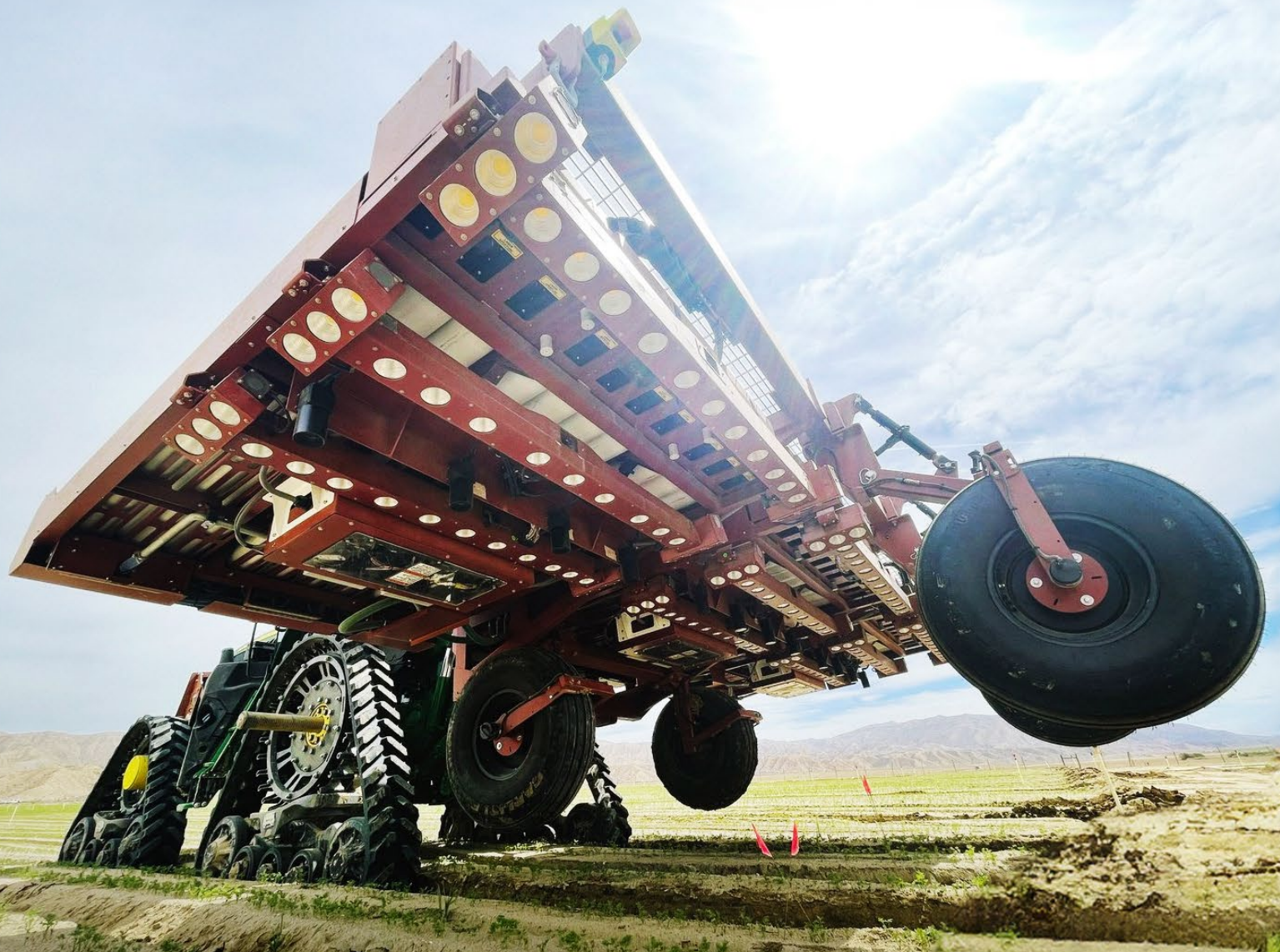
FIGURE OUT THE FINANCIALS FOR YOUR FARM

If you'd like to do the math for any automation equipment or technology on your farm, please contact the Innovation Team at innovation@wga.com .